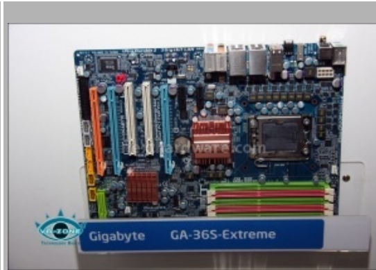
Gigabyte GA-36-S Extreme