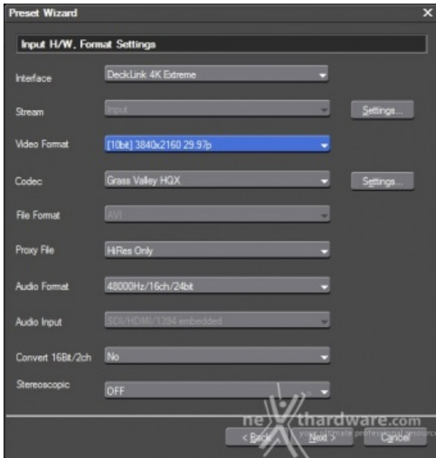
Connessione HW di terze parti