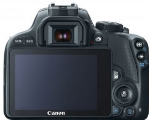
↔ Canon EOS 100D

Se all'esterno la reflex Canon s'è ristretta, dentro invece presenta una serie di features di tutto rispetto: sensore APS-C CMOS da 18MPixel , processore DiGiC 5 , AF Ibrido , video FullHD 30/25/24p e