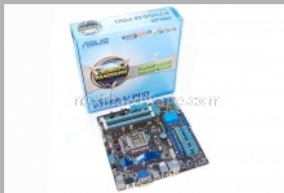
Asus P7H55-M Pro